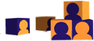
Making sure that 2+2 does make 5...